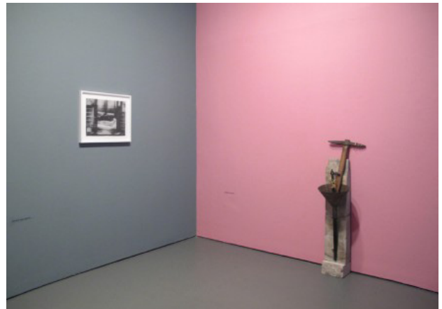
Looking Back / The 8th White Columns Annual (Installation View)