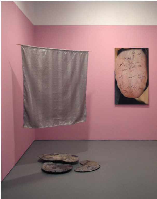
Looking Back / The 8th White Columns Annual (Installation View)