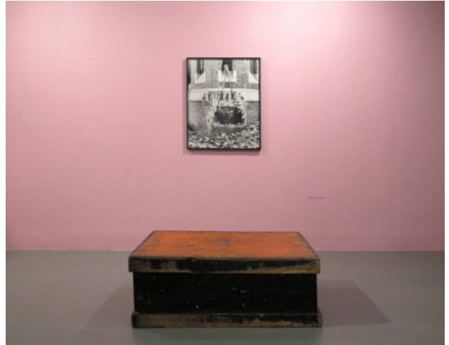
Looking Back / The 8th White Columns Annual (Installation View)