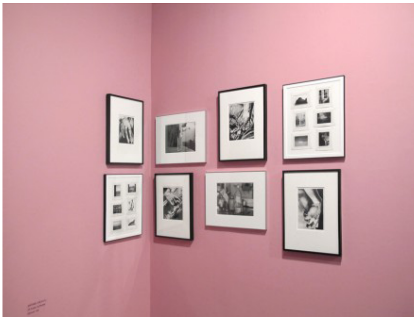
Looking Back / The 8th White Columns Annual (Installation View)