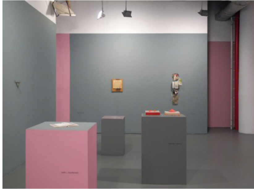
Looking Back / The 8th White Columns Annual (Installation View)