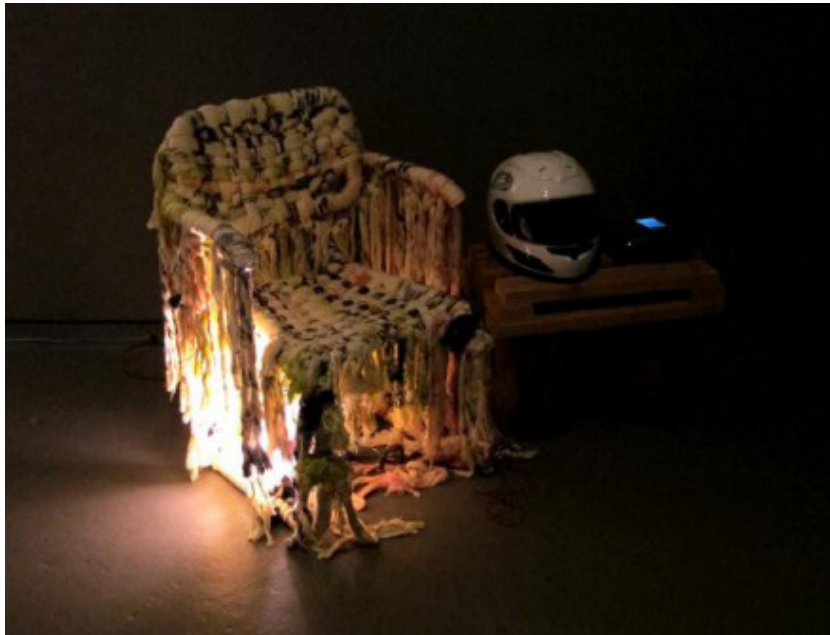
Lucy Dodd and Sergei Tcherepnin at The White Columns Annual, All Images via White Columns