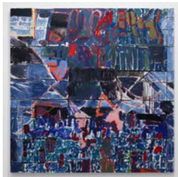
Pam Glick Life Starts Now - A Page from Marilyn Monroe's Diary , 2015 Oil and enamel on canvas 72 x 72 in. (Inv# PG003)