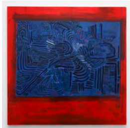
Pam Glick Flanges , 2016 Oil and enamel on canvas 48 x 48 in. (Inv# PG029)