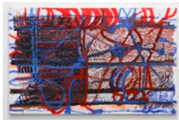
Pam Glick 2 Niagaras , 2016 Oil and enamel on canvas 38 x 60 in. (Inv# PG030)