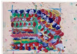
Pam Glick NF Incolor , 2015 Oil on board 9 x 12 in. (Inv# PG027)