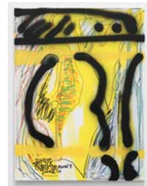
Pam Glick Bag of Toys JFK-Phoenix , 2016 Oil and enamel on canvas 24 x 18 in. (Inv# PG024)