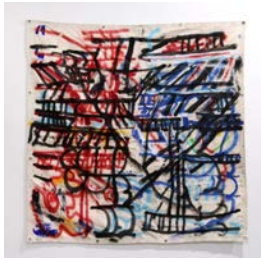
Pam Glick Niagara-USA-Canada , 2016 Oil and enamel on unstretched tarp 64 x 67 in. (Inv# PG005)