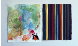
" O O F $ I V Burial of the Sardine, no. 8, 2015 Watercolor on paper 21 x 18 in., 20 x 16 in. (Inv# ANC012)