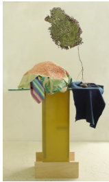
" O O F $ I V 6 O E F S X B U F S 3 B U U V T 0 L [ H G P H G L D Z R R G J O D V V D Q G I D E U L F [ [ L Q , Q Y $ 1 &